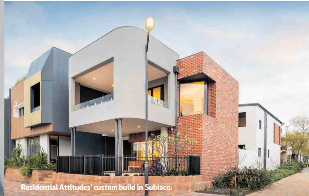
Residential Attitudes’ custom build in Subiaco.