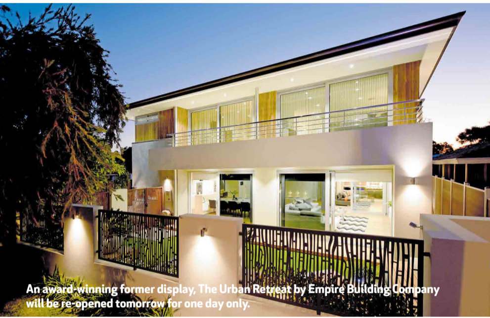
An award-winning former display, The Urban Retreat by Empire Building Company will be re-opened tomorrow for one day only.